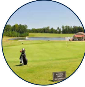
Brickshire Page 8