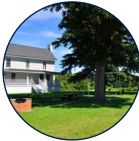
White Hall Page 13