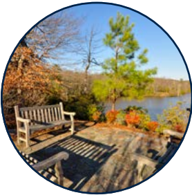
Stonehouse Page 11