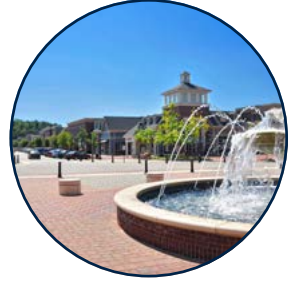
New Town Page 10