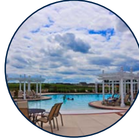
Colonial Heritage Page 9