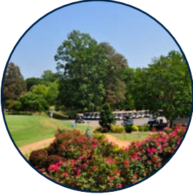
Ford's Colony Page 4