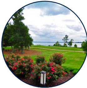
Governor's Land Page 12