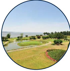
Kingsmill Page 6