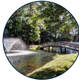
Seasons Trace Page 14