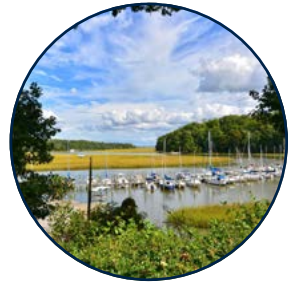
Queens Lake Page 15